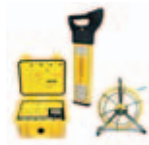
DIGISYSTEM™ Service Locator Tools